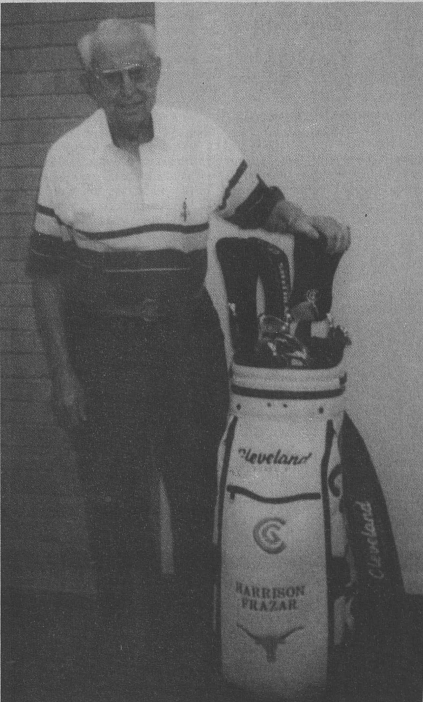
More Study Club...